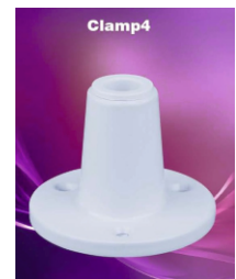
TABLE TOP MOUNT CLAMP 4 OPTIONAL

Designed for Assembly and electronic and conformal Coating UV inspection