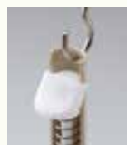
GS-108/158 Hole for hook